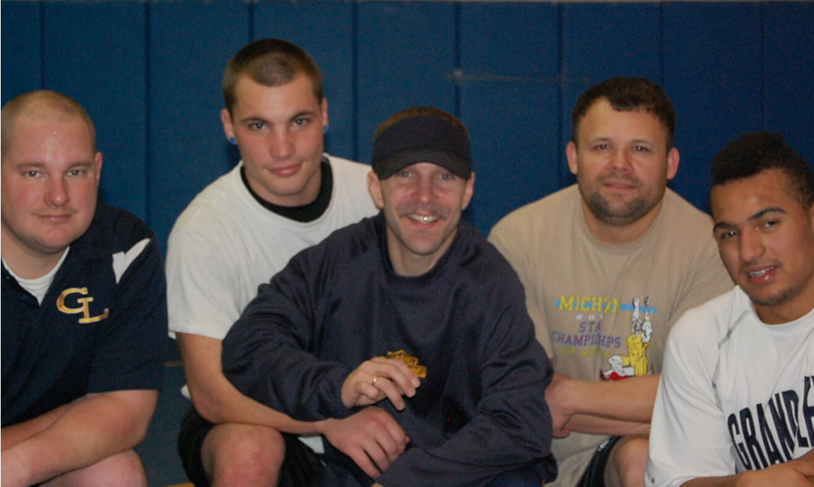
Coaching staff, Grand Ledge Wrestling Club – 2011 – Folkstyle, Youth